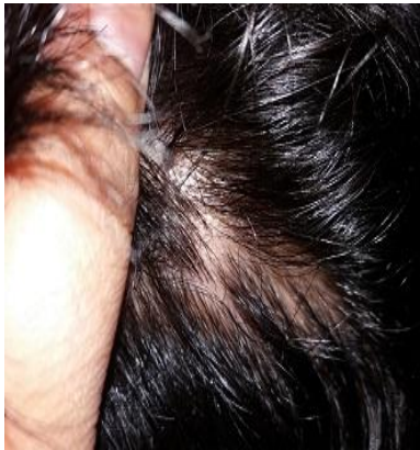
Fig-1 BEFORE TREATMENT