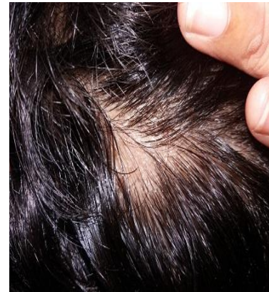
Fig – 2 AFTER TREATMENT