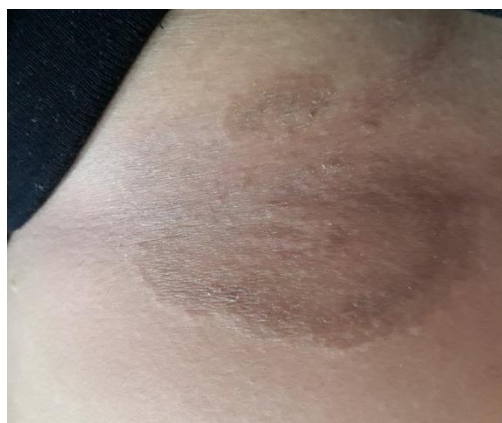
Fig.2. After 1 month of treatment