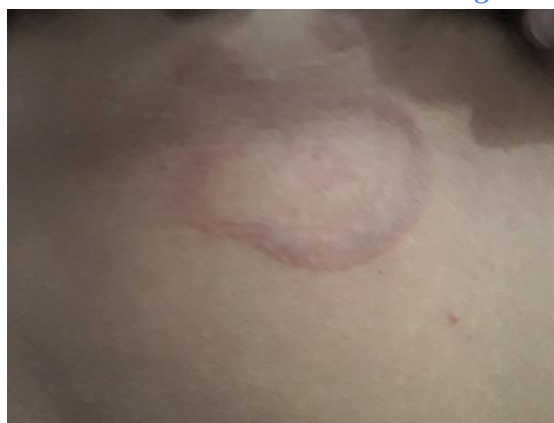
Fig.1 before Treatment-