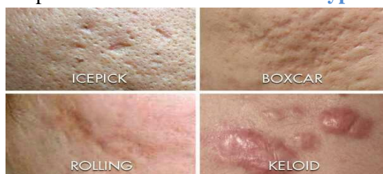
Chart showing treatment of scar depends on depth and width of it