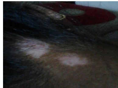
(b) back of neck