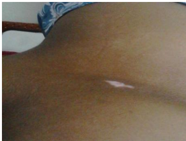
Fig 1 . Before treatment patch on (a) back

Before Treatment: white colored patches on back of neck ,back region with itching on patches, Acidity and Constipation