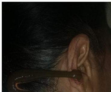
4 th Setting