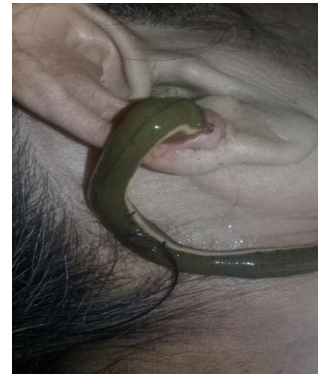
3 rd Setting