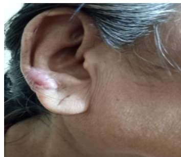
After 10 months