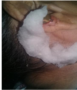
2 nd Setting