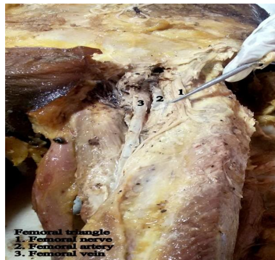
Fig. 2 Femoral triangle

DISCUSSION: The study was carried out in two parts literature study and cadaveric study. Lohitaksha Marma is situated above Urvi Marma and below Vankshana Sandhi (hip joint) at the root of the Uru . On injury this causes paralysis of the muscles or thinning of the Sakthi (lower limb) due to loss of blood. Based on predominance of Material Matrix or anatomical structure, it is Sira Marma . On the basis of fatal effect of injured Marma , Lohitaksha Marma is Vaikalykara Marma . Vaikalykara Marma are those Marma which are having union of three belonging to the anatomical matrix. Vaikalykara Marma are dominated by the attributes of Jala Mahabhuta . Jala Mahabhuta is stable and cooling. Therefore, any injury to this Marma does not result in death but always cause a deformity that may persist forever. Total number of Lohitaksha Marma is four - 1 in each limb. 8